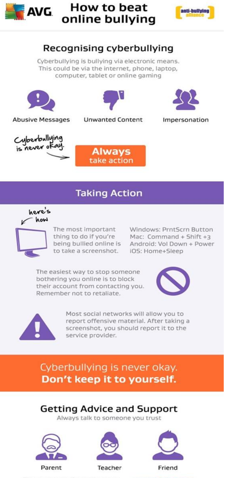
There are lots of organisations that can give you advice and support:

www.childline.com www.iwf.org.uk www.childnet.com